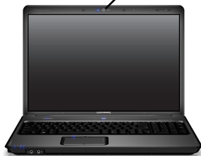
SES SITE COMPUTER