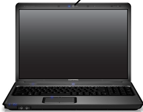
SERVICE LOCATION COMPUTER